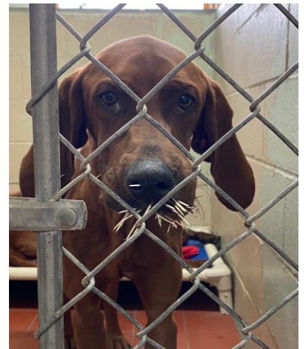
Helped 249 Lost Pets.