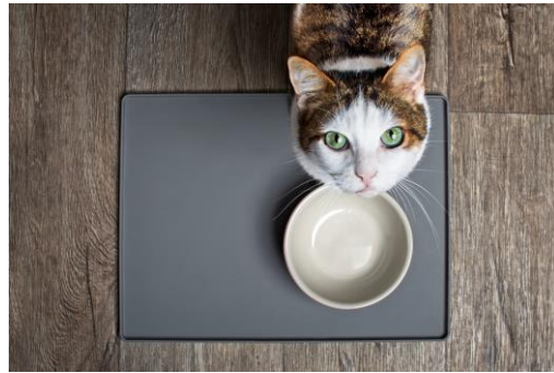
Pet Food Pantry & Community Food provides thousands of pet meals.

THANK YOU for being a Friend to WCHS. Your support impacts the lives of hundreds of animals and people each year.