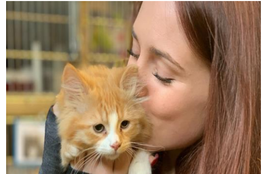
507 Pets Find New Loving Homes