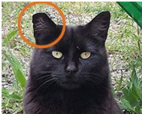
Ear tip = universal cue a cat is part of a TNR program.

74 feral cats got “fixed” for free in 2021 during the monthly Spay/Neuter Clinics thanks to donations and grant funding.